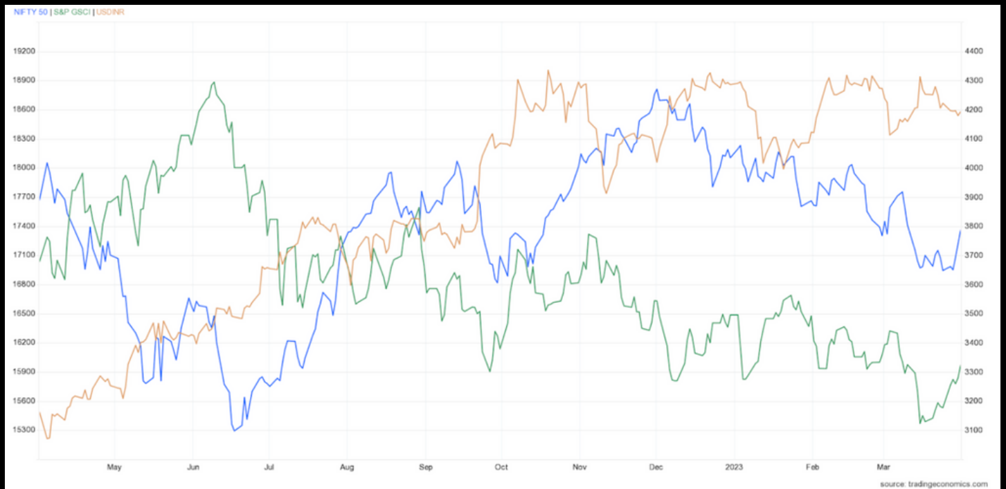
Green Line indicates S&P GSCI | Blue Line indicates Nifty 50 | Orange Line indicates USDINR

This chart shows the movement of equity, currency & commodity market.